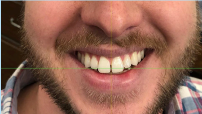
Before & After